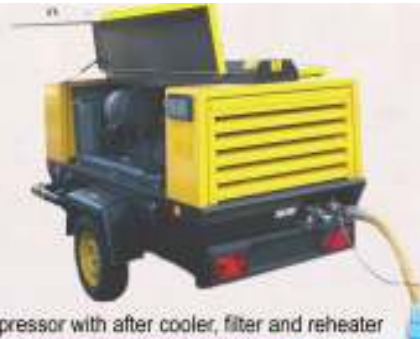
Special Compressor with after cooler, filter and reheater