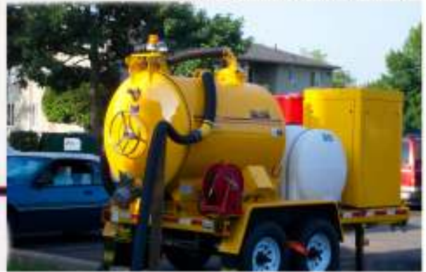
VacTron with media and dust collection

The APL Method is equally effective on pipe systems with angles, branches and changing pipe diameters from 1/2" to 10" and in lengths up to 500 feet.